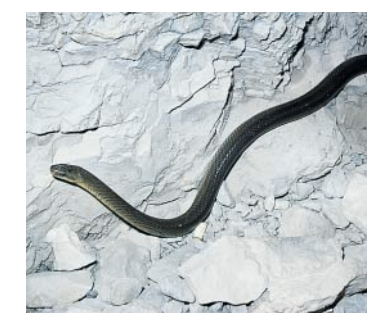
The harmless Aesculapius snake – here in the first tunnel – grows up to two metres in length.

a head for heights are required, particularly on the steep metal steps.